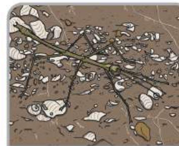
in and on soil